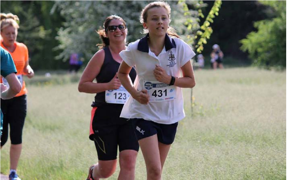
TAS TALKS | 13