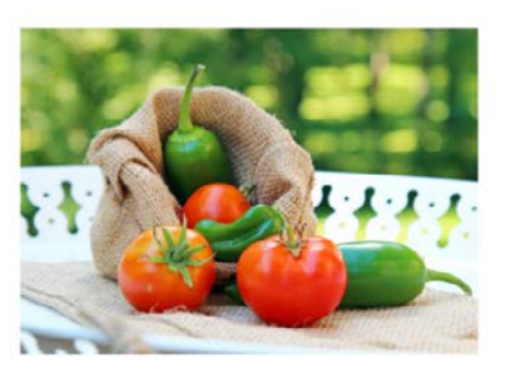
All plants will be sold on a first come first served basis, so come early while supplies last!