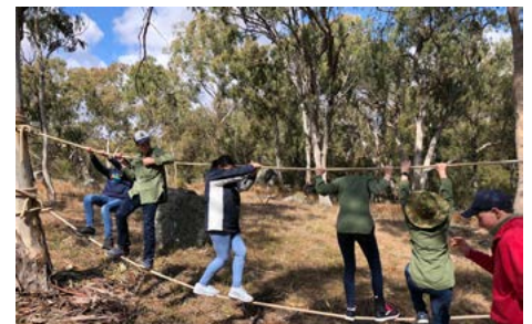
Year 6 Bush Skills on Activities Day