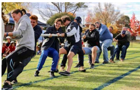
Fathers' Day Tug-O-War at lunchtime on Friday August 31 - please join us for lunch at 1225 in the Junior School covered area.

We will be celebrating Father's Day this Friday 31 August at lunchtime in the Junior School covered area. We welcome all those meaningful males in the lives of our students to come along and join us for lunch and a handful of games and activities. We hope you can be with us at lunchtime (lunch provided from 12.25 – 1.15 pm) and please, don't forget your runners (and to stretch before you become involved in any strenuous exercise – physio and chiropractic consult not provided.....)