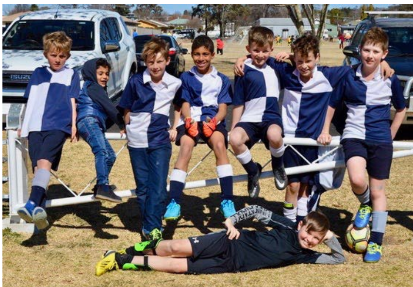
TAS Blue Footballers - played a really strong game with some players away with illness