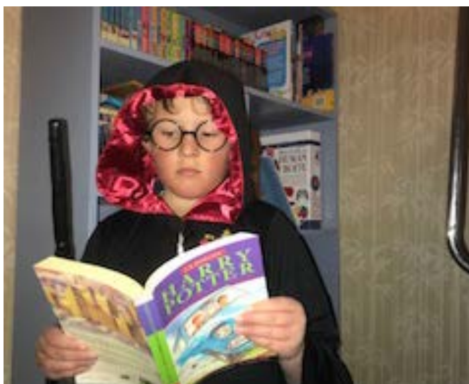
Shelfie.....Harry Potter himself!

Everyone is welcome to join us for our Book Parade in the Hoskins Centre from 9.00 am - 9.45 am to watch the Parade and the fantastic selection of 'Shelfie' photographs that have been submitted. (If your child is yet to send in a photo, or you have no idea what I am talking about please ask them!)