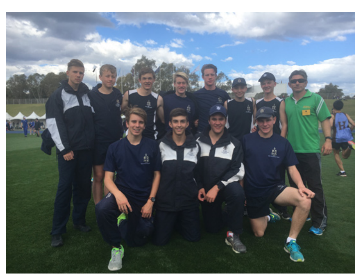
TAS GPS Team