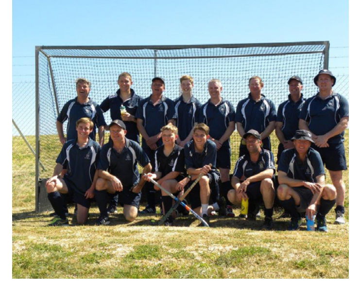
The Hockey New England Men's C Grade premiers - a terrific mix of students, staff, parents and Old Boys!